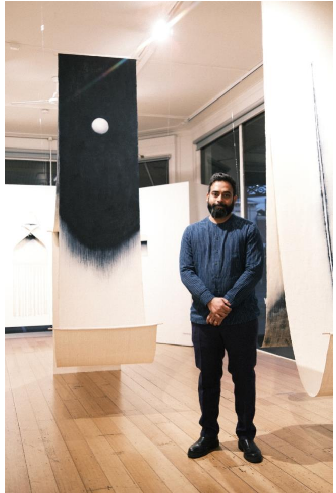
Kaimurai, 2025 ATW International Artist in Residence.

In 2026 ATW will celebrate 50 years producing exceptional quality, handwoven tapestries in collaboration with contemporary artists. Our tapestries are commissioned globally for public and private collections.