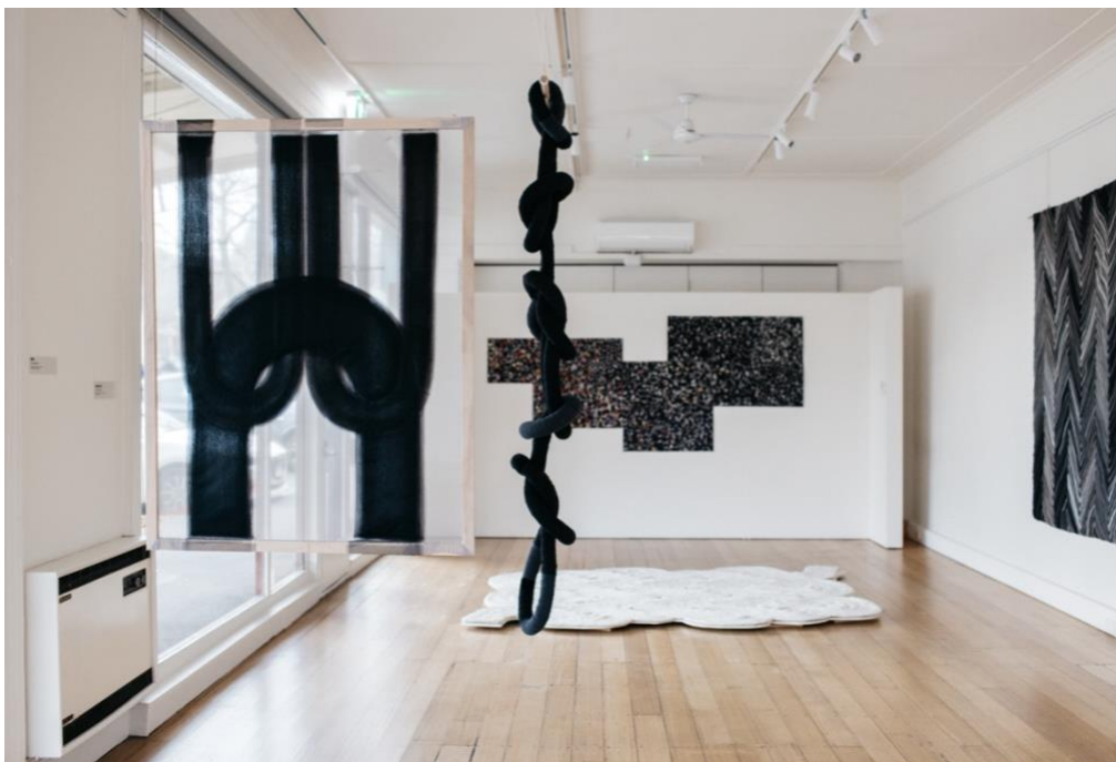
Installation view of 'ON-GOING' in the ATW International Artists in Residence. Gallery. Exhibition by Studio Brieditis & Evans, the 2023 International Artists in Residence.